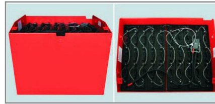
Battery with automatic water inlet device