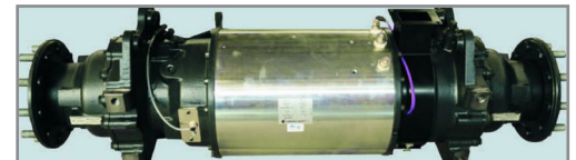
AC drive motor