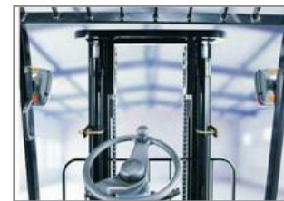
Newly designed wide-view mast • lessens blind area